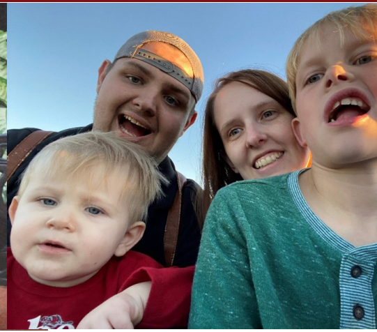
Family Fun at Blooms & Berries (2022)